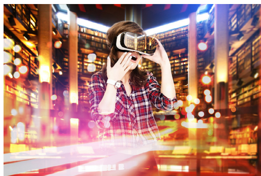
Figure 1 Classroom walls create an artificial boundary around a science lesson. How can science teachers communicate the power, relevance and limitations of science to their students when and if those walls become permeable?

Before delving into the strategies we have designed to help teachers to cross subject compartments and develop epistemic insight, it is useful to compare how England's Department for Education's curriculum requirements for different subjects identify the aims of each subject. Table 1 contains the aims of the GCSE (age 16 exam) programmes of study requirements for nine subjects: computer science, mathematics, combined and single science, religious studies, geography, English literature, English language and history. The programmes of study outline the content that exam boards must evaluate in national tests, which means there are specific outcomes each student should reach in each subject. They are key to understanding the core content that is delivered to students in the classroom. Studying the text in each box reveals that unless a teacher is clued up to look