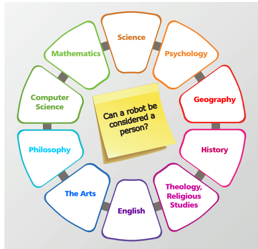
Figure 3 The discipline wheel for contextualising the focus of a lesson

You can then go through the different disciplines in the wheel and try to view the question or topic through that particular perspective: how do theology, geography, history and mathematics seek to answer ‘ What makes us human? ’ In this way, you can show students how the disciplines connect across topics and questions, and how much is lost if we only use one discipline lens to learn about and make sense of our reality. The discipline wheel and the subjects contained within it can be adapted to different stages of education to ensure students have an adequate understanding of each discipline depicted.